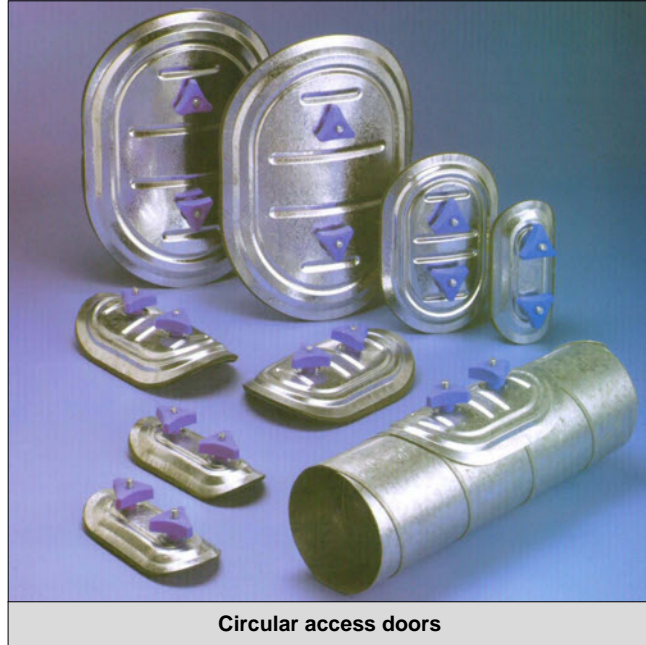
Circular access doors

Conical spring loaded bolts allow for easy separation of the two doors, whilst the door design prevents the inner portion from falling away completely.