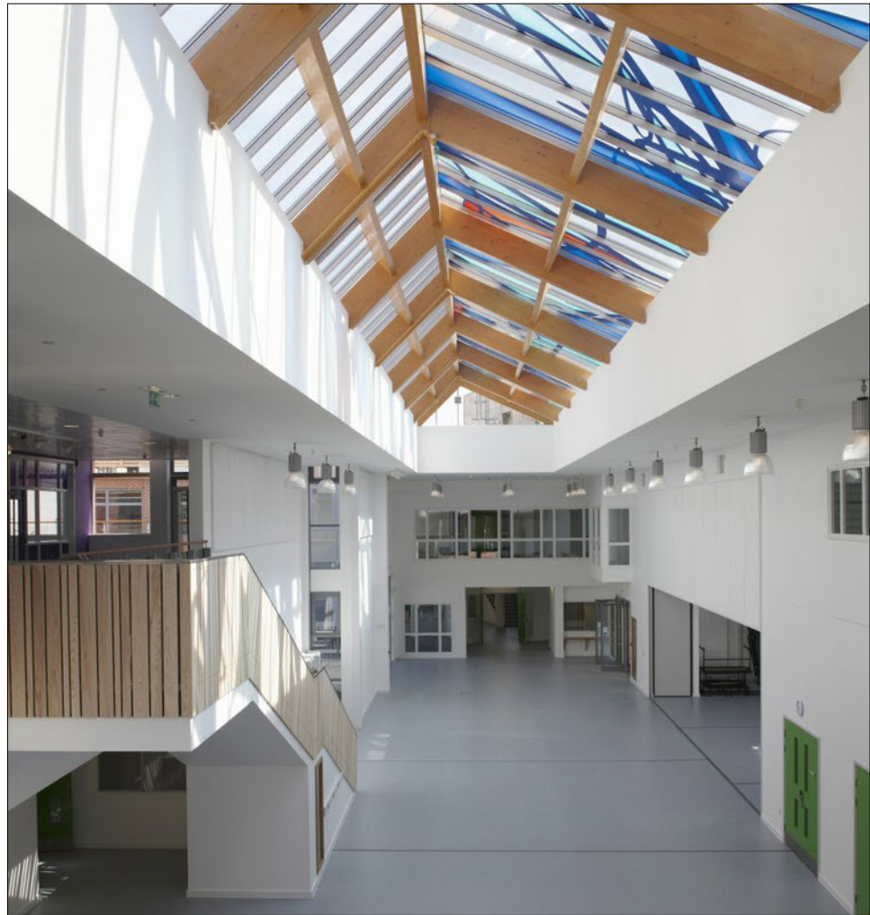
Main entrance and lobby

As part of the drive towards cleaner public buildings, it was intended from the outset to be an environmentally friendly building, benefitting from the most efficient systems possible, including a stack type natural ventilation system.